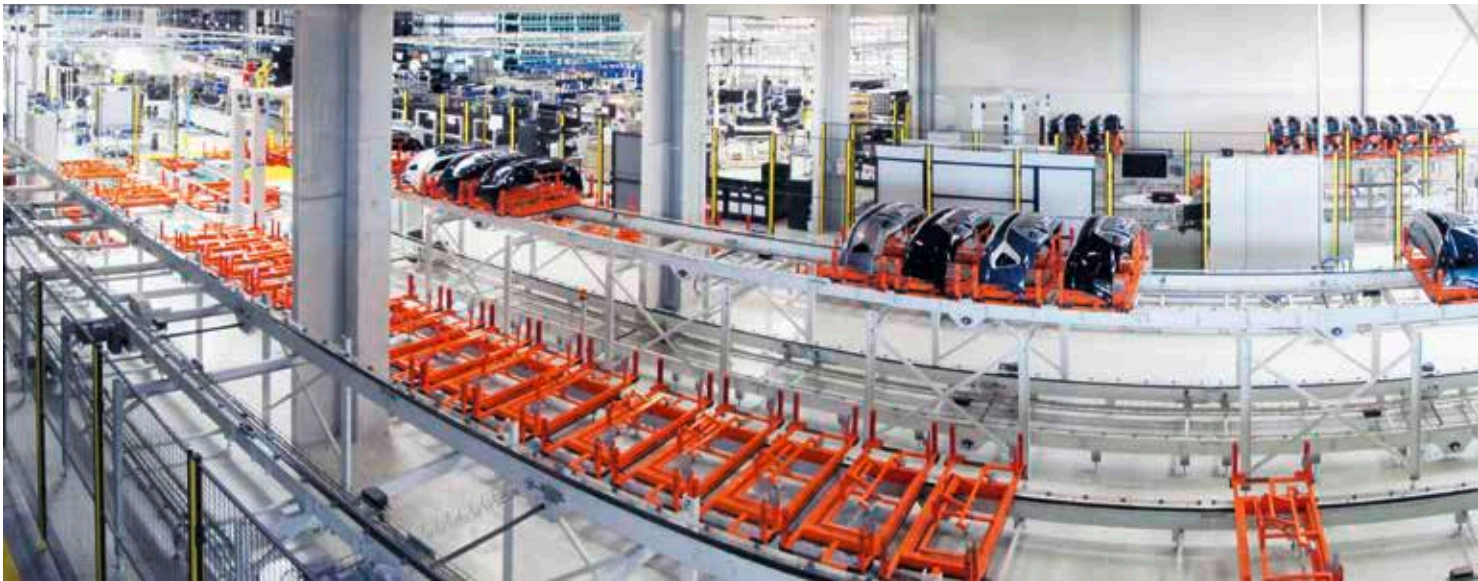
Spread-out Production Plant: bumpers "just-in-sequence" thanks to atvise®.

Belgian company VMA specializes in ready-to-use automation solutions. Their customer, an electric vehicle bumper supplier for a major European automotive group, needed to update to a cost-effective, just-in-time production line. atvise® delivered a clear visualization.